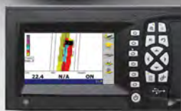
Mapping Color Display