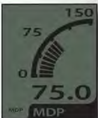
Cat Compaction Control - MDP Gauge on Standard LCD Display